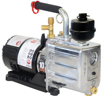
DV-285DC, 10 CFM DV-240DC, 8 CFM