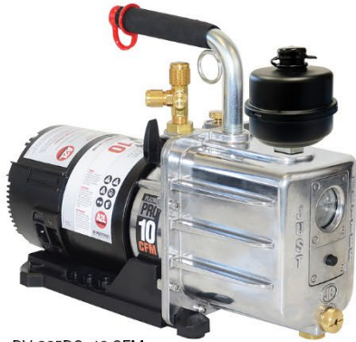
DV-285DC, 10 CFM DV-240DC, 8 CFM