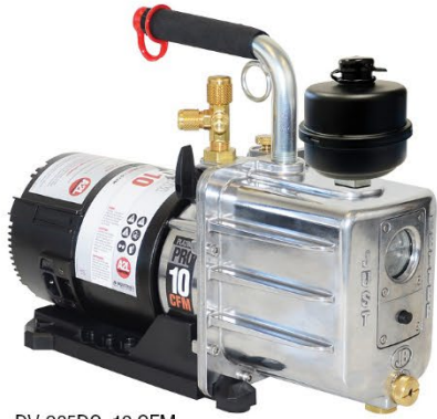
DV-285DC, 10 CFM DV-240DC, 8 CFM