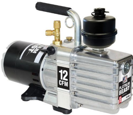
DV-340N PLATINUM BEAST 12 CFM Vacuum Pump