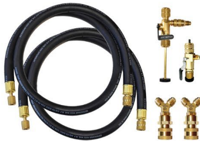
VL-200 ACCELERATOR Rapid Evacuation Kit